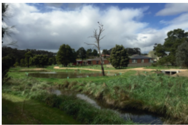
Before and after photographs of the Brown Hill Wetlands.

path and installed new post and rail fencing.