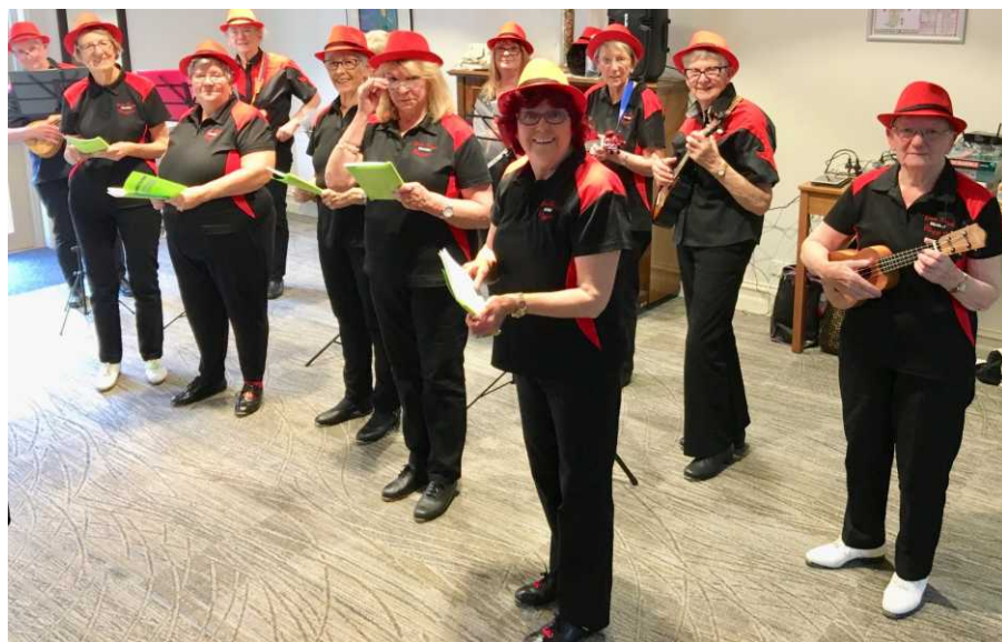
The Dixie Doozle Ukulele Players lead a sing-a-long at Kelaston Residential Home.