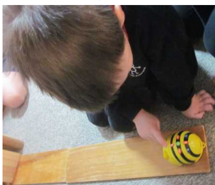
Programming 'bee-bots' with the Caledonian Primary School students.