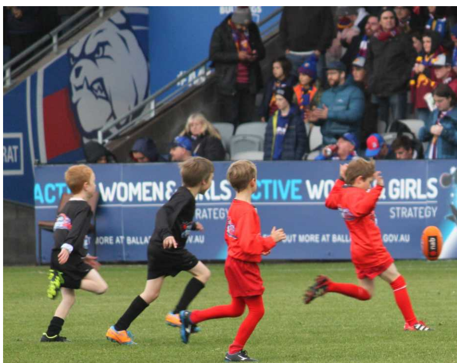
The AusKick kids had a ball on Mars Stadium.