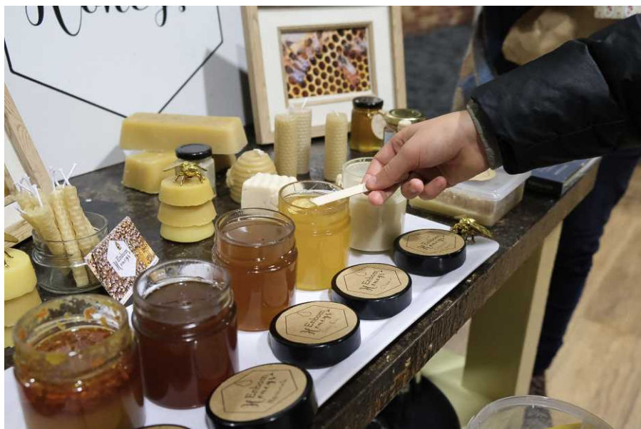
Tasting Enbom Honey at the Open Day.

The BWC opening hours are: 9.00 am - 11.00 am and