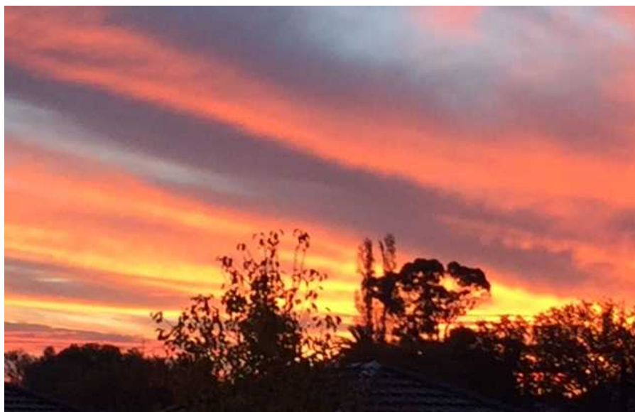
Sunset over the rooftops at Hemsley Park Retirement Village.