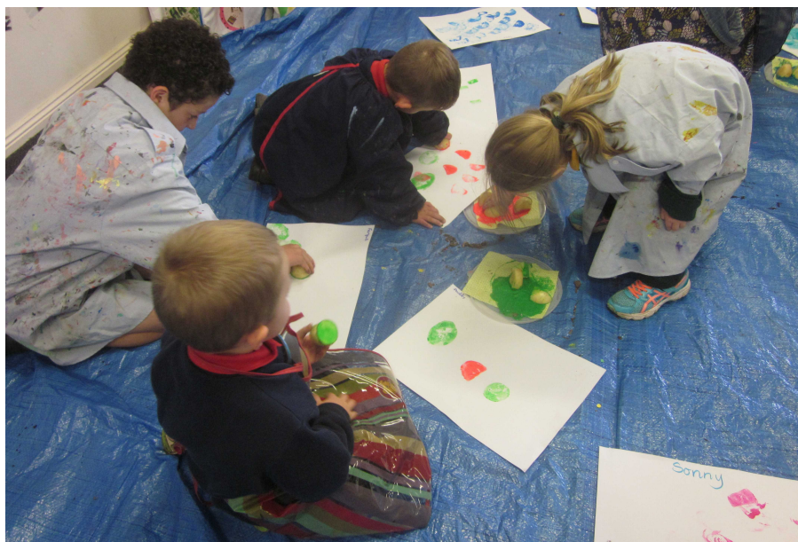
Children from Brown Hill Kindergarten's Red Group using potatoes to make prints during their visit to St Mary's Primary School in Clarke's Hill.