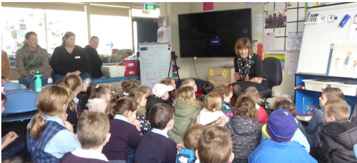
Children from Brown Hill Kindergarten's Blue Group visited St Brendan's Primary School in Dunnstown.