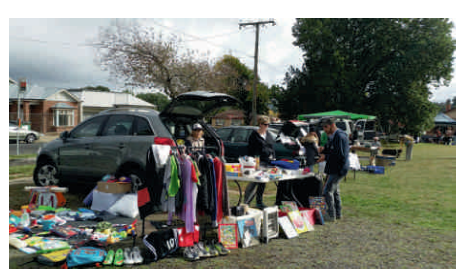
Car Boot Sale at the Brown Hill Uniting Church Fair

Sunday 28: 1:00pm, Old Ballarat Cemetery tour run by Ballarat and District Genealogical Society Inc. during Ballarat Heritage Weekend. Focus on graves of the 1850s. Cost: gold coin donation. Contact: Neva Dunstan on 5330 7005.