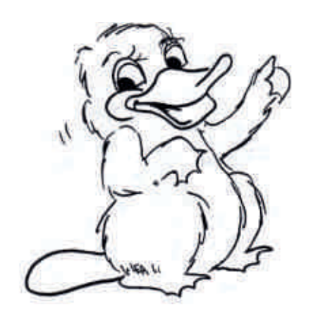
FireAware mascot, Penny Platypus

The FireAware Network is looking for Brown Hill residents who are interested in forming their own