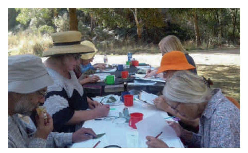
Experiencing a small part of the Yarrowee through botanic art

We began the evening with a run down of some of the amazing traits of these fascinating froggy creatures (they use their eyeballs to help them eat!) and listened to recordings of their mating calls. We then had a short walk, trying to hear some live local frogs. Unfortunately, as is often the case with fauna surveys, we did not hear any due to the large crowd and windy conditions. However, this did not dampen the enthusiasm of the group, who were happy to have the time to sit quietly and listen to nature as well as catch-up with their human neighbours.