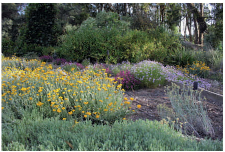
Ballarat's local trees, shrubs and ground covers provide a profusion of colour and texture to brighten this spring-time garden

If walking or riding the Yarrowee Trail north of the Western Freeway, you might notice that a significant number of guards and stakes have been removed from young plants. At a 'Clean-up Australia Day' event and regular monthly working-bees, members of Wattle Flat-Pootilla Landcare Group (WFPLG) removed twothirds of a skip of rubbish and "unveiled" several hundred new young plants.