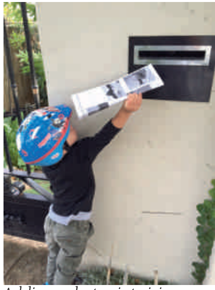
A delivery volunteer in training

We are so proud of the immediate success of our volunteer newsletter delivery team! Editions 5 and 6 were delivered to your letterbox and local businesses and community hubs across Brown Hill by an enthusiastic group of 20 volunteers. Each volunteer received between 100 and 200 copies of the newsletter, which they delivered to a designated area close to their home. You can read about two of our delivery volunteers in this edition, John the Postie (p.1) and Sue Walker (p.10). We've included photos of