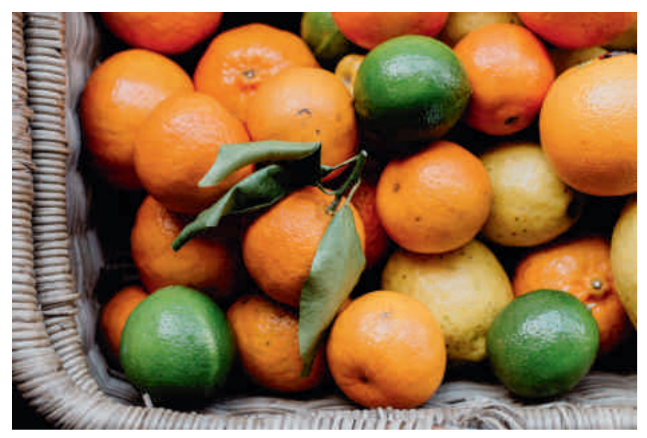
Seasonal Local Organic Wholefood - Open Day on Wednesday 3 May Image: Grounded Pleasures

You can keep up to date with information about the Pool by following the Facebook page