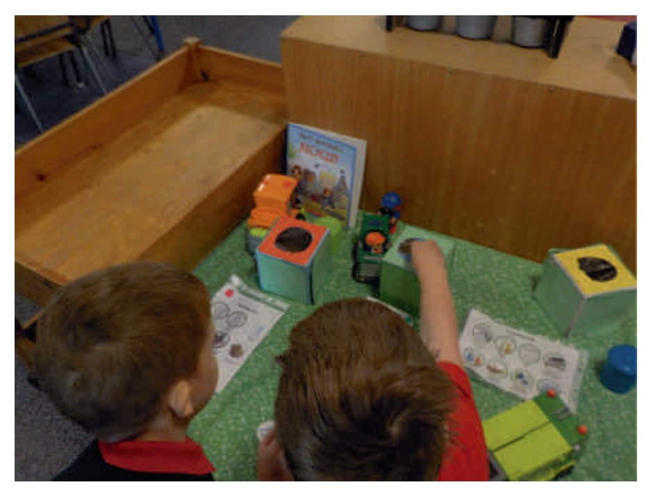
Brown Hill Kindergarten children learning about recycling our rubbish

http://ecka.org.au/earlychildhoodcentres/kindergartenspreschools/ brown-hill-kindergarten