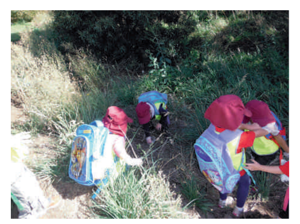
Brown Hill Kindergarten children helping to 'clean up Australia' along the Yarrowee River

help the children develop an increasing knowledge of and respect for natural and constructed environments and to develop an awareness of the impact of human activity on environments and the interdependence of living things.