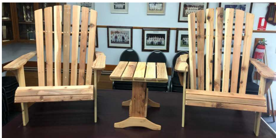
Outdoor setting $150

To find out more, contact Phil Knowles on 0407 399 971.