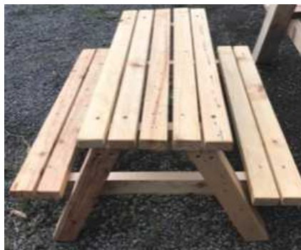
Outdoor Table & Seat set, Large $200, Kids $100.