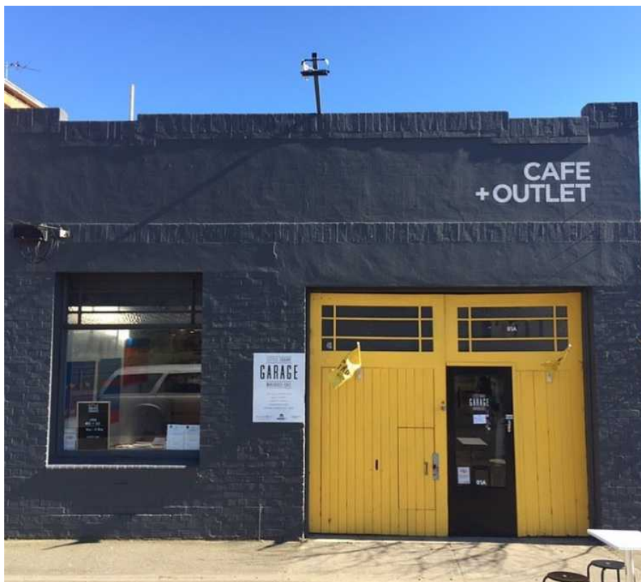
Little Square Garage is at 81A Humffray Street North. Image supplied.

brands such as Mustard Made, Sage x Clare, Bambury and more. We have sourced organic, delicately roasted Bun Coffee from Byron Bay, soul-hugging toasties and irresistible sweet treats which deliver superior quality and bang for your buck, sure to bring you back through our big yellow doors. Our vision is simple – create a space that's welcoming to absolutely anyone.