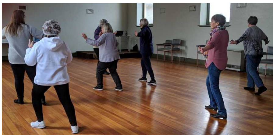
Tai Chi class at the Ballarat East Neighbourhood House.