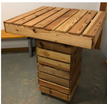
Bar table $100