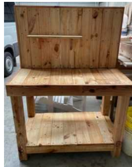
Workbenches - Adult $200, Kids' $100