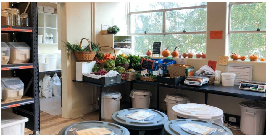
Inside the Ballarat Wholefoods Collective space at BGT, Barkly Square.