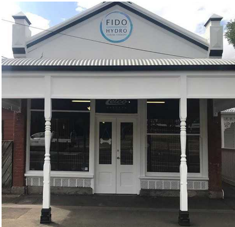
FIDO HYDRO is at 89 Humffray Street North.

treadmill equipment, with advanced technology.