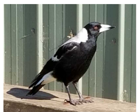
An Australian Magpie at Caledonian Primary School.

They are pied in colour (black and white) with a sharp, pointed beak ideal for digging up insects - or ripping flesh from bone. While they are charming in our perspective, Magpies are the largest most widespread predatory avian species in Ballarat.