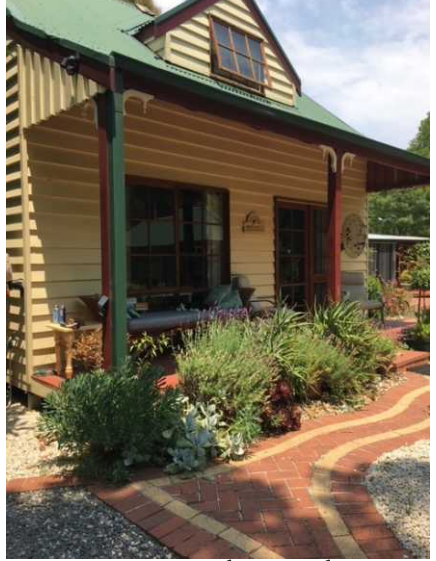
Yarrowee Cottage.

Within a few years the Lands Department had sprayed, burnt and bulldozed our side of the river and the hill over the other side. As a result, the Yarrowee River walking track was constructed and