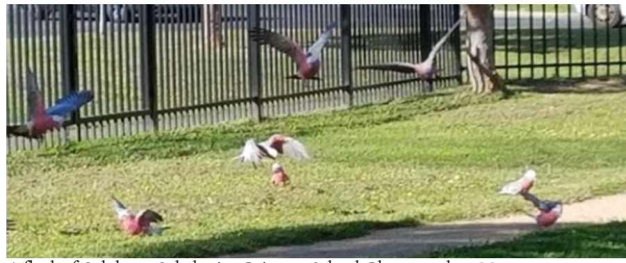
A flock of Galahs at Caledonian Primary School.