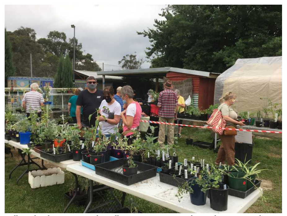
Ballarat locals supporting the Ballarat Community Garden at their Festive Plants and Preserves Sale.

Volunteers were recruited to run the stalls and ensure that COVID-19 regulations were observed to