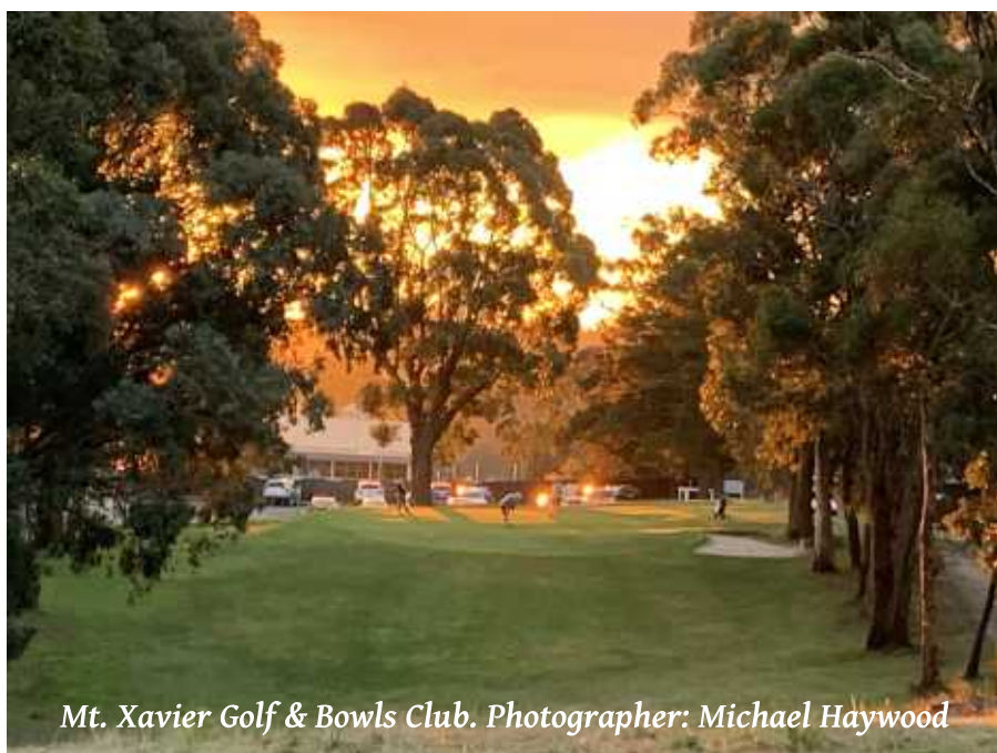
Mt. Xavier Golf & Bowls Club.

During this period the club has had success on the sporting fields as well. In 2021, Mt. Xavier won the Ballarat District Golf Incorporated Handicap pennant title. In 2022 the club also added the Scratch division title to its list of achievements. This was the club's 4th highest level victory in fourteen years.