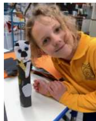
Some creative student artwork.

Another highlight last term was a visit from Samuel Johnson (Actor and Philanthropist) who spoke to us about the importance of early detection of cancer and his charity Love Your Sister. The visit was arranged by local charity Twin Hearts. Samuel also displayed his skills on the unicycle!