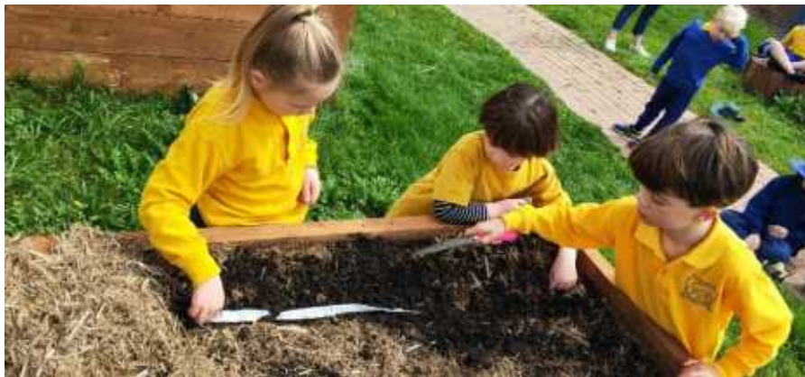
Students helping out with planting at school. Image supplied.