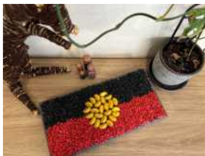
Some lovely artwork.

(Over 3s) yard and this year our Waa (Under 3s) yard is having their turn! We look forward to watching, listening and observing all the works happening and will excitedly await the finished product.