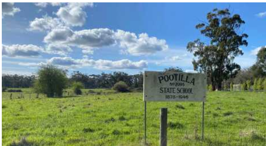
The Pootilla State School site on Ballarat-Daylesford Road today. No buildings exist.

Ring us on 5334 5360 to arrange a visit.