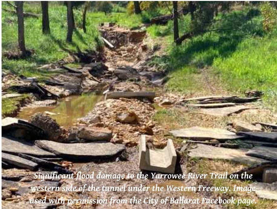
Significant flood damage to the Yarrowee River Trail on the western side of the tunnel under the Western Freeway. Image used with permission from the City of Ballarat Facebook page.

with anyone affected by the floods. We hope this important section of the Yarrowee River Trail is able to be repaired over the coming months so we can get back out to enjoy this beautiful space. Please take care around the damaged sections of the trail as the soil may be unstable and observe the 'Track Closed' signs.