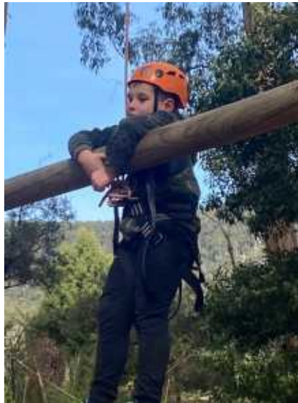
Fun on camp!

skateboarding lessons, provided by Y Ballarat. In fact, I was personally inspired by this to get 10 new skateboards for our school to introduce a skateboarding club. Skateboarding is something I still enjoy, so it has not been hard to bring in a new and exciting sport for our students. We have focused on year 4-5 girls initially, building their confidence and resilience!