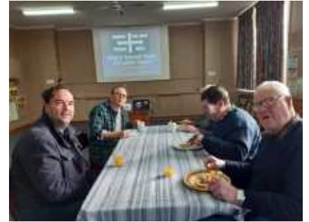
Men's Breakfast.

battle over unfairly high gold licence charges and led to the Eureka Stockade Rebellion on 3 December, 1854. This was closely followed by the formation of the Ballarat Trades and Labour Council in 1883, one of the oldest unions in the world, and in conclusion he focused on current issues facing workers, one of the largest being their mental health.