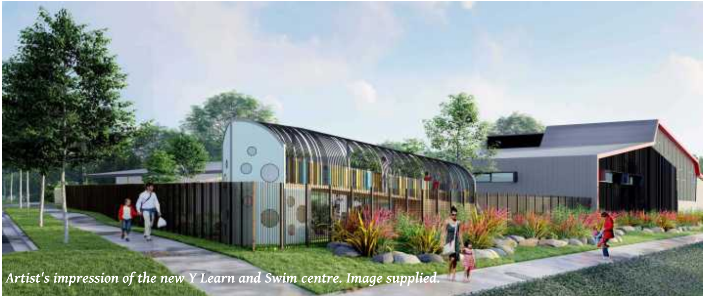
Artist's impression of the new Y Learn and Swim centre.

While there's been plenty of mud and rain recently, there's also been plenty of progress at the site for Y Ballarat's new innovative centre located in Water Street, Brown Hill. Y Learn and Swim is on track to open early 2023. The centre will offer long day care, kindergarten and swimming lessons all in one location, helping to smooth out all those drop-offs and pick-ups for families.