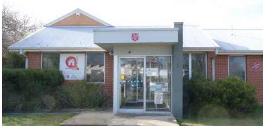
Ballarat North Neighbourhood House, 6 Crompton Street, Soldier's Hill. Image supplied.

There has been some interest in the local community for the house to start a ukulele class! If you think you may like to join, please contact us. Start dates to be confirmed.