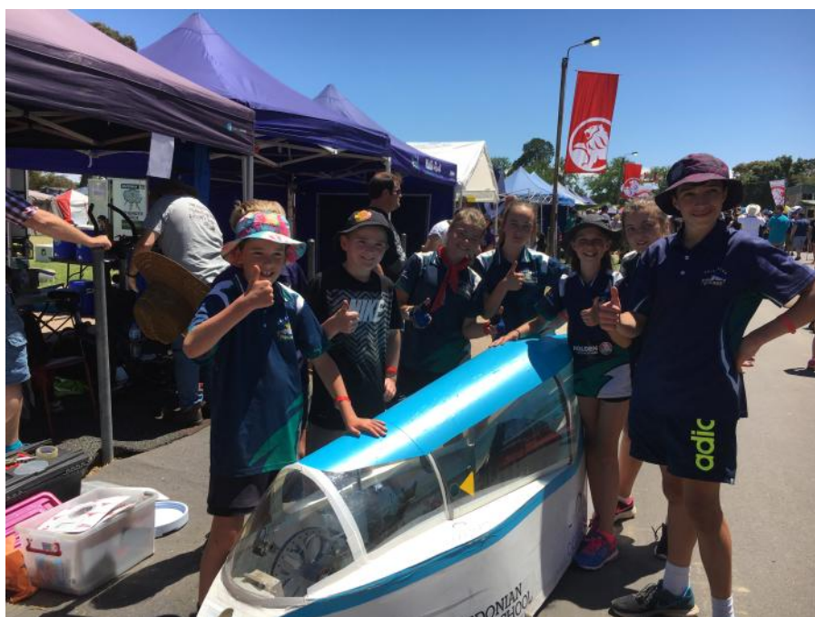
Caledonian Primary School students participating in the Energy Breakthrough.