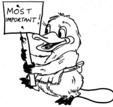
Fire Aware Mascot, Penny Platypus

As all Cluster contacts are volunteers living in the neighbourhood, I asked Jeff (the contact for the Janson Road/Stringybark Drive Cluster) some questions about why he is involved.