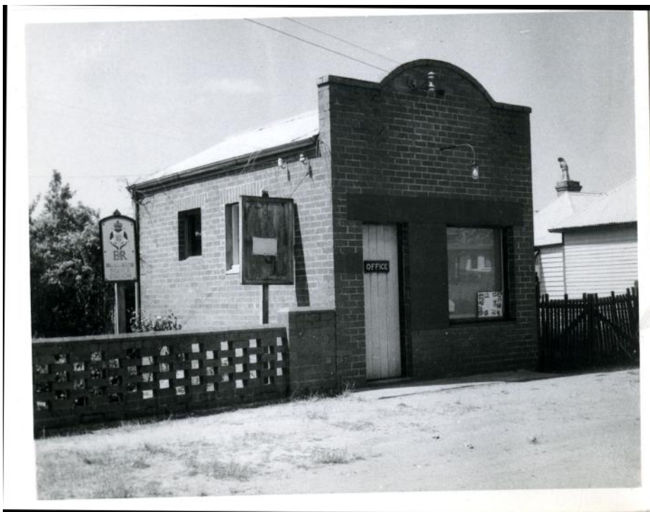
The old Brown Hill Police Station at 359a Humffray Street North (corner of Thompson Street), circa 1956.

An initiative of the Brown Hill Community Partnership, supported by the Brown Hill Progress Association and the City of Ballarat. We are proud to walk this land with the Wadawurrung people.