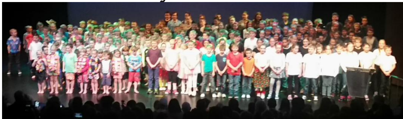
Caledonian Primary School students performing 'Newspaper Mama' at the annual concert.