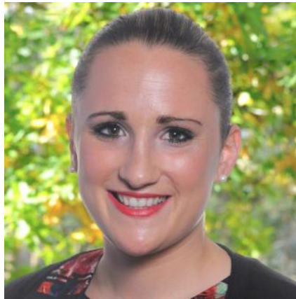
Cr. Amy Johnson. Image supplied.

Dedicated crews clean up our streets, city entrances, waterways, parks, gardens and recreation reserves. We also have public-