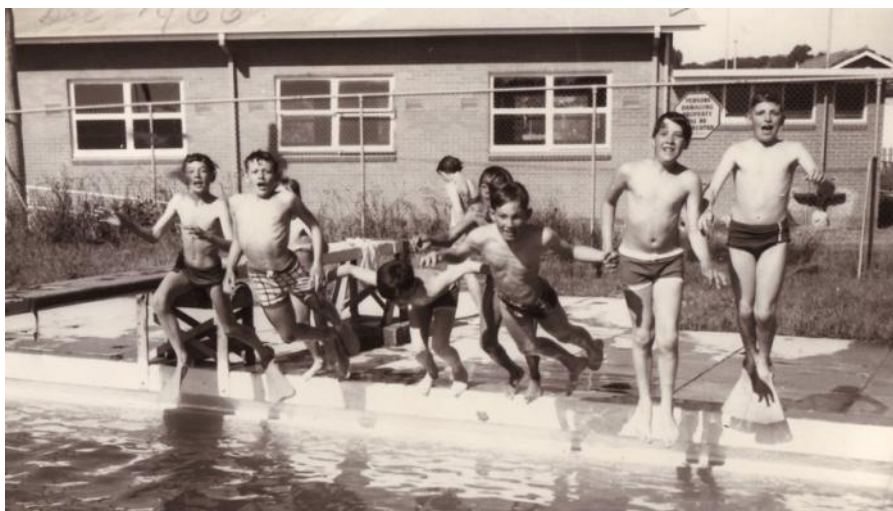
A number of boys jump into the Brown Hill Pool, 1966.