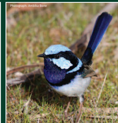
Superb Fairy-wren Malurus cyaneus Size: 14cm