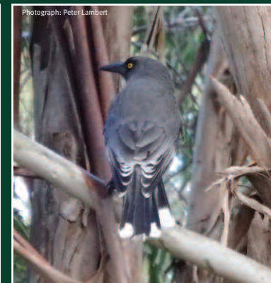
Grey Currawong Strepera versicolor Size: 45-53cm