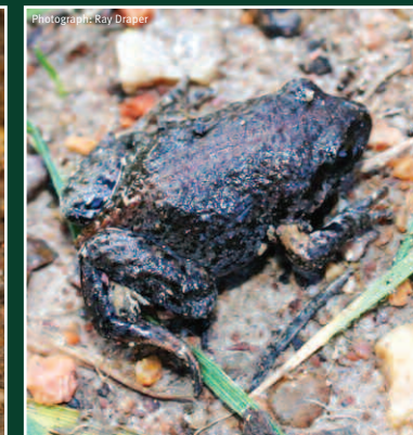
Victorian Smooth Froglet Geocrinia victoriana Call: Long 'wa-a-a-a-ark' then trilled 'pip pip pip' Length: to 35mm