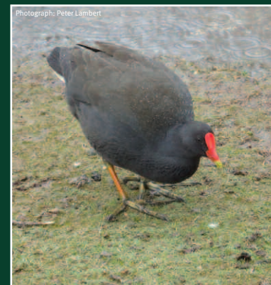
Dusky Moorhen Gallinula tenebrosa Size: 35-42cm