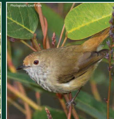
Brown Thornbill Acanthiza pusilla Size: 10cm