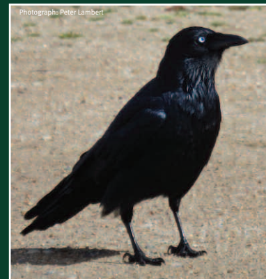
Little Raven Corvus mellori Size: 50cm