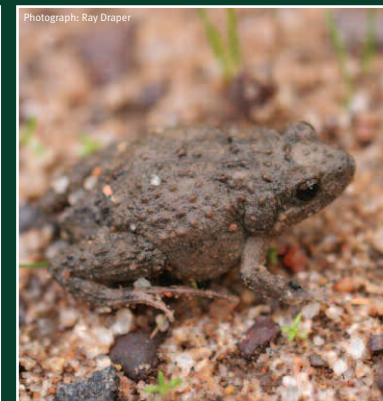
Plains Froglet Crinia parinsignifera Call: Long high-pitched 'eeeeeeeeek' Length: to 30mm