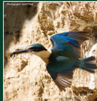
Sacred Kingfisher Todiramphus sanctus Size: 19-23cm