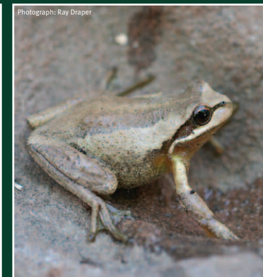
Southern Brown Tree Frog Litoria ewingii Call: High pitched 'creee-creee-creee-creee' Length: to 40mm