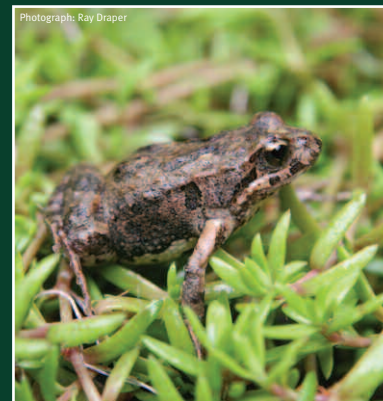
Common Froglet Crinia signifera Call: High-pitched chirrup 'crick crick crick' Length: to 30mm