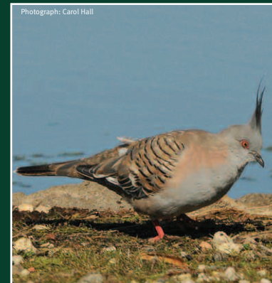
Crested Pigeon Ocyphaps lophotes Size: 31-35cm