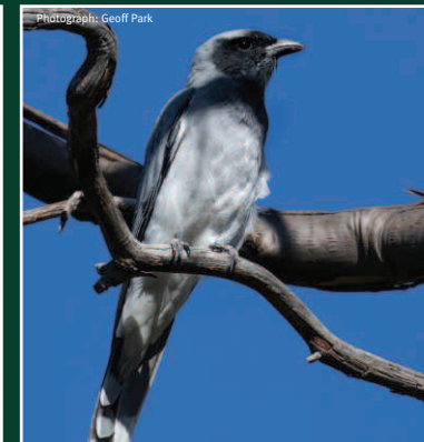
Black-faced Cuckoo-shrike Coracina novaehollandiae Size: 33cm