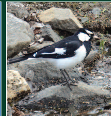
Magpie-lark Grallina cyanoleuca Size: 27cm