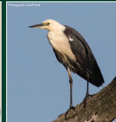
White-necked Heron Ardea pacifica Size: 75-100cm