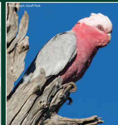
Galah Eolophus roseicapilla Size: 36cm