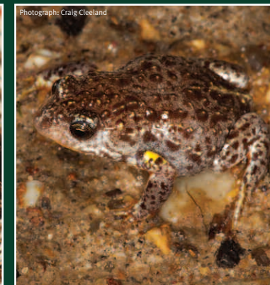
Southern Toadlet Pseudophryne semi Call: Repeated, very short harsh grating 'cre-ek' Length: 22-32mm