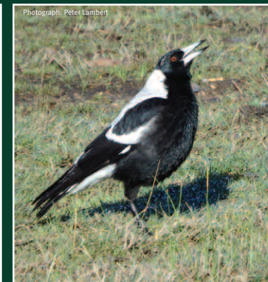
Australian Magpie Gymnorhina tibicen Size: 34-44cm