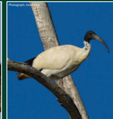
Australian White Ibis Threskiornis molucca Size: 68-75cm