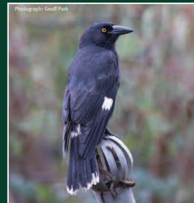
Pied Currawong Strepera graculina Size: 41-51cm