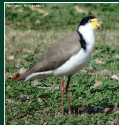
Masked Lapwing Vanellus miles Size: 35-38cm