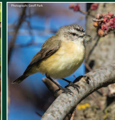
Yellow-rumped Thornbill Acanthiza chrysorrhoa Size: 10-12cm