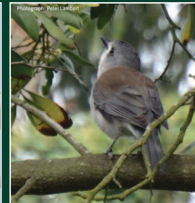
Grey Shrike-thrush Colluricincla harmonica Size: 22-23cm