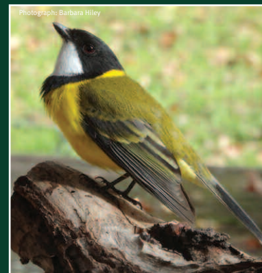
Golden Whistler Pachycephala pectoralis Size: 17cm