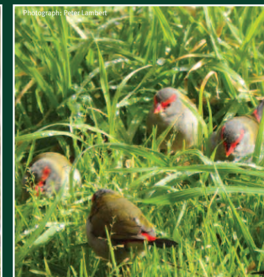
Red-browed Finch Neochmia temporalis Size: 11-12cm