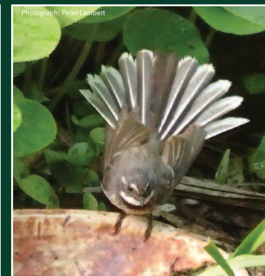
Grey Fantail Rhipidura albiscarpa Size: 16cm