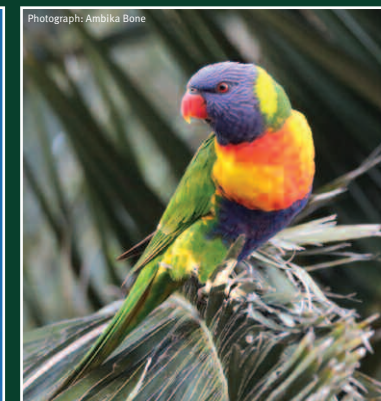
Rainbow Lorikeet Trichoglossus haematodus Size: 25-30cm