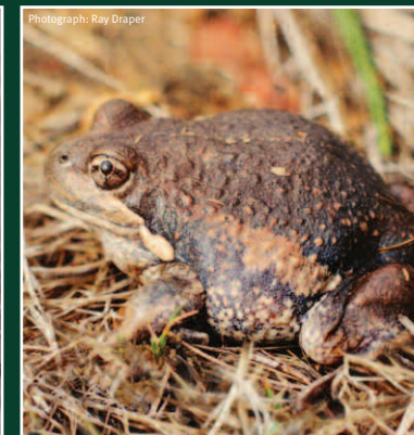
Eastern Banjo Frog Limnodynastes dumerilii Call: Musical 'bonk'; chorus creates 'pobblebonk' Length: to 70mm