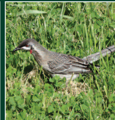
Red Wattlebird Anthochaera carunculata Size: 31-39cm