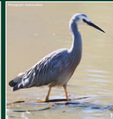
White-faced Heron Egretta novaehollandiae Size: 65-70cm