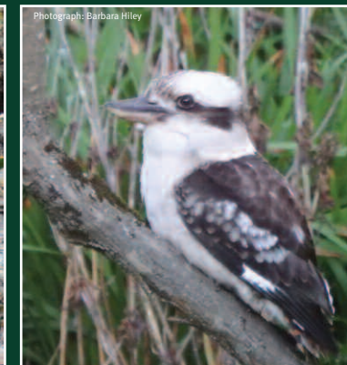
Laughing Kookaburra Dacelo novaeguineae Size: 46cm