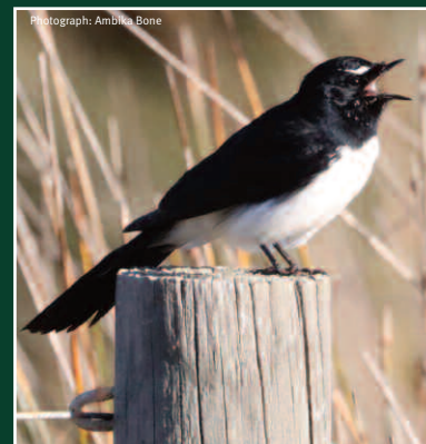
Willie Wagtail Rhipidura leucophrys Size: 20cm