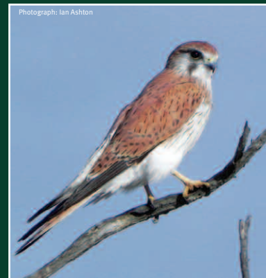
Nankeen Kestrel Falco cenchroides Size: 31-35cm