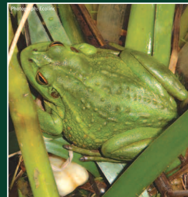
Growling Grass Frog Litoria raniformis Call: Short growl 'crawark-crawark croc croc' Length: to 80mm