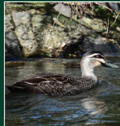
Pacific Black Duck Anas superciliosa Size: 47-61cm