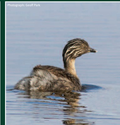
Hoary-headed Grebe Polioccephalus poliocephalus Size: 27cm