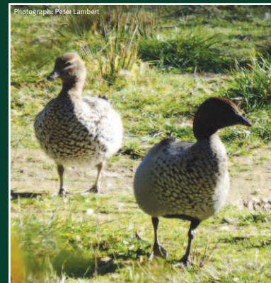
Australian Wood Duck Chenonetta jubata Size: 48cm