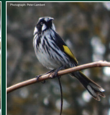
New Holland Honeyeater Phylidonyris novaehollandiae Size: 16-19cm