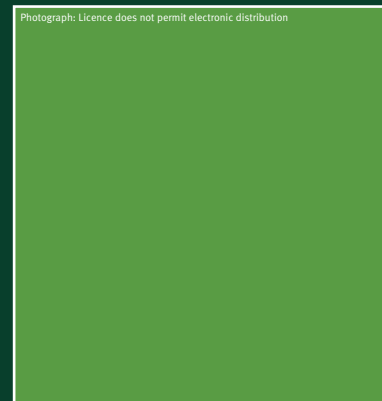
Common Spadefoot Toad Neobatrachus sudelli Call: Long trill 'cra-aw-aw-aw...awk' Length: to 40mm