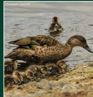
Grey Teal Anas gracilis Size: 37-47cm