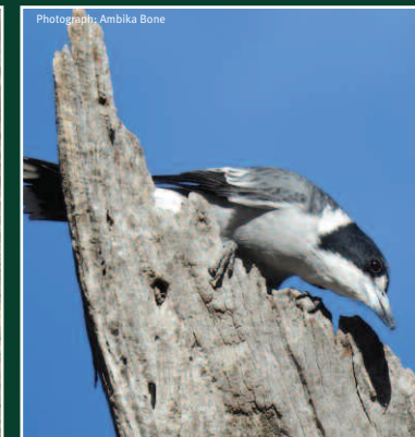
Grey Butcherbird Cracticus torquatus Size: 28-32cm