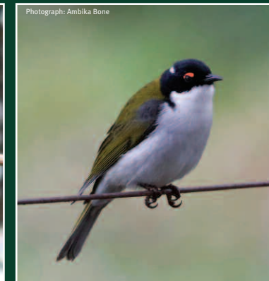
White-naped Honeyeater Meliphreptus lunatus Size: 13-15cm