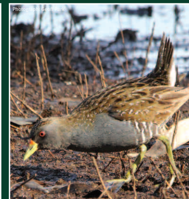
Australian Spotted Crane Porzana fluminea Size: 19-21cm