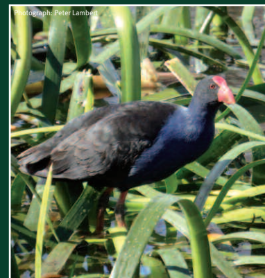
Purple Swamphen Porphyrio porphyrio Size: 45-52cm