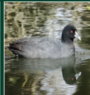
Eurasian Coot Fulica atra Size: 32-42cm