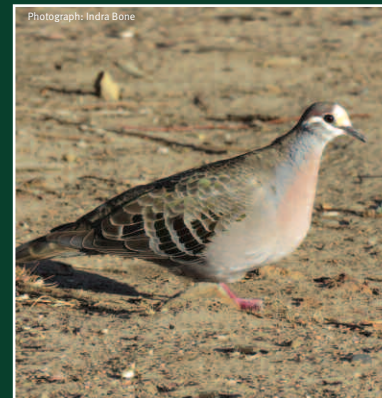
Common Bronzewing Phaps chalcoptera Size: 33-36cm