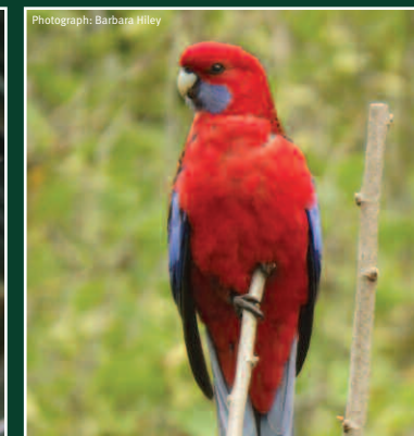
Crimson Rosella Platycercus elegans elegans Size: 32-36cm