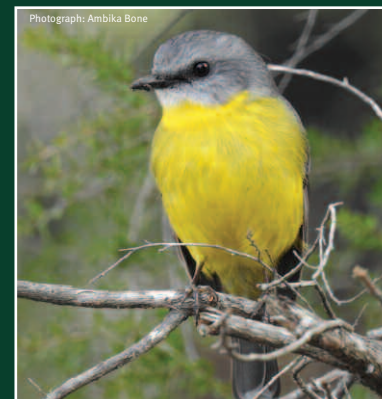
Eastern Yellow Robin Eopsaltria australis Size: 15cm