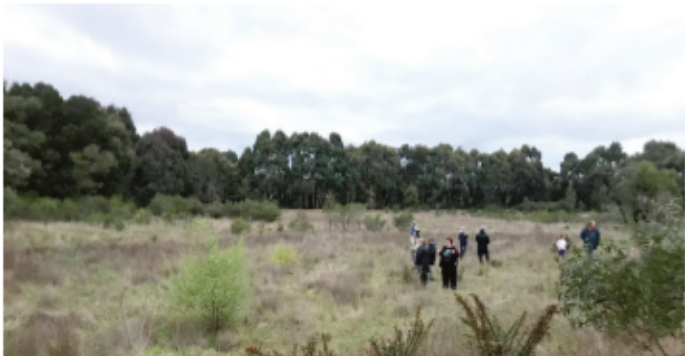
Connecting to Nature 2.0 'Frog Walk' (October 2018)