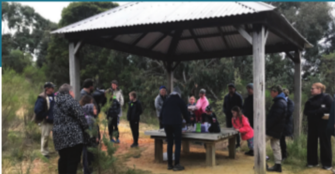
Connecting to Nature 2.0 'Frog Walk' (October 2018)