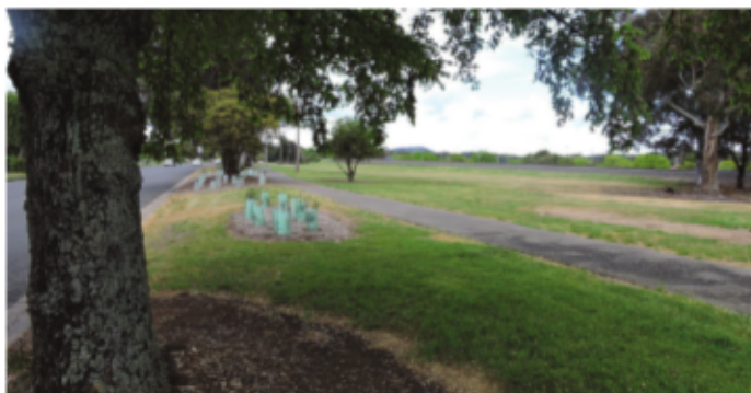
Uplifting of trees on Scott Parade (November 2017)