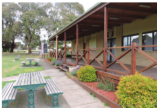
Brown Hill Cricket Club Rooms Kitchen, Carpet and Furniture Upgrades (August 2016)