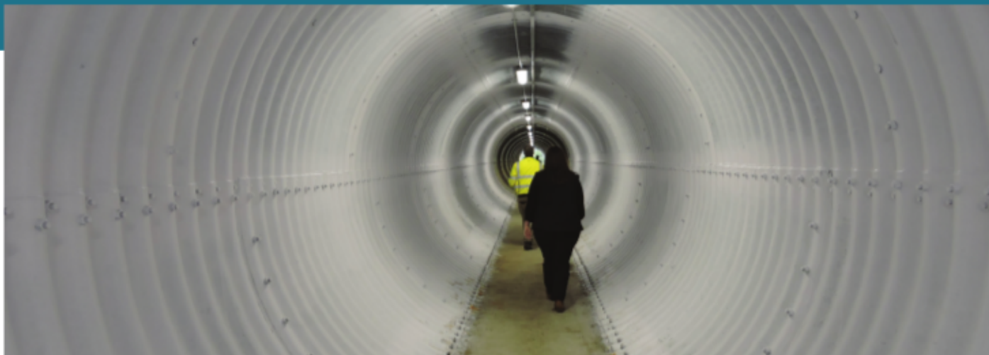
Lighting of Brown Hill Tunnel (April 2015)

A number of other projects were completed as a result of consultation with the Brown Hill Community - here's a taste of what else has happened!