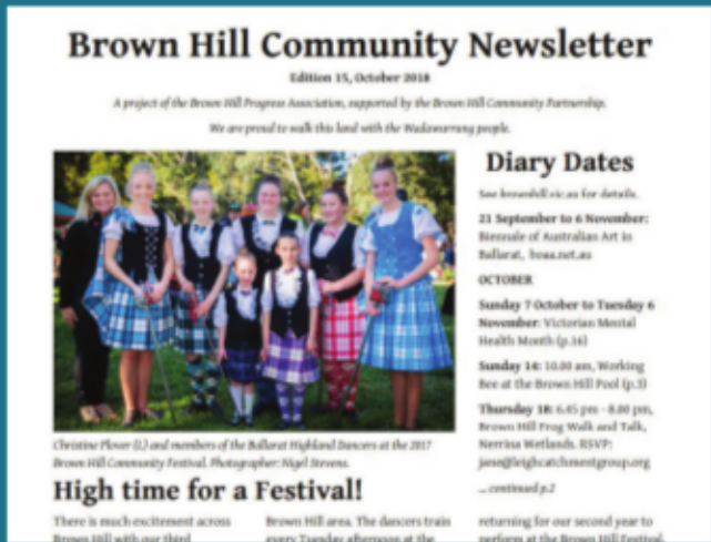
Brown Hill Community Newsletter (funded December 2015, ongoing publication)