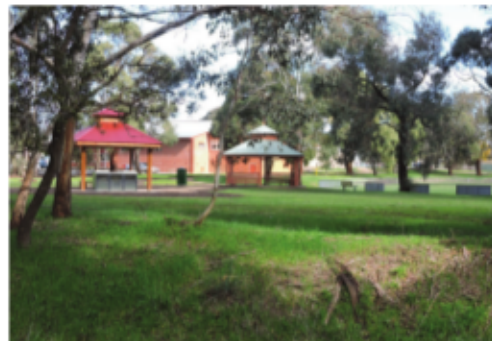
BBQ and Shelter (August 2016)