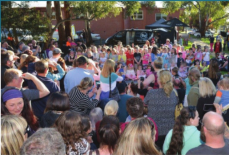
Brown Hill Community Festival (funded 2016, ongoing)