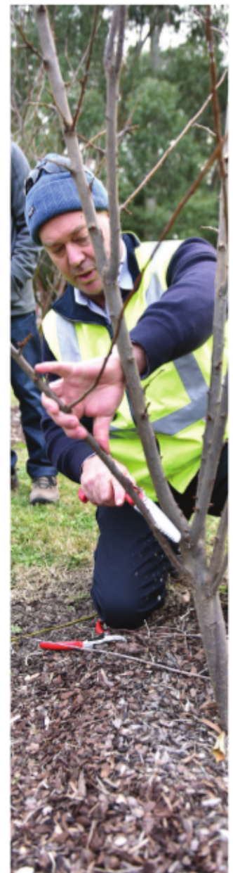
Fruit Tree Planting (August 2016)