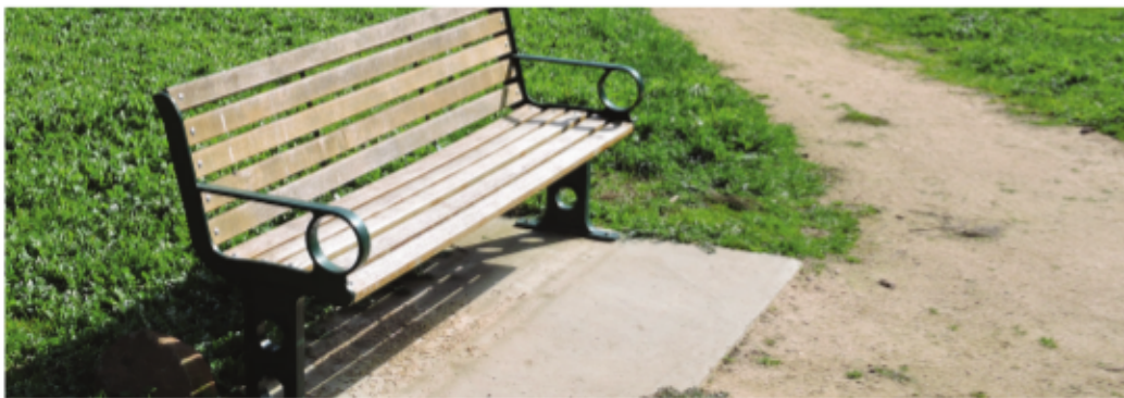
Pathway Improvement and Park Furniture (August 2016)