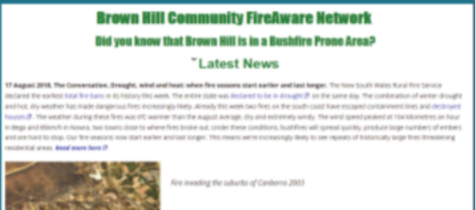
PLEA Network 'FireReady' Project (funded May 2016, ongoing initiative)