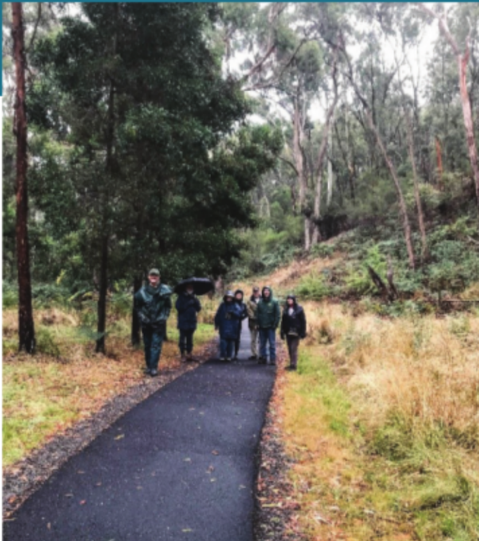
Connecting to Nature 2.0 Bird Watching (April 2018)