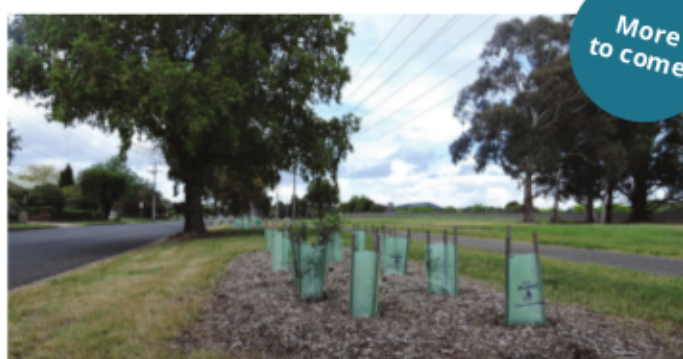
New garden beds on Scott Parade (November 2017)