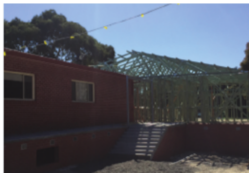
Brown Hill Hall (funded March 2016, expected completion for current upgrade is early 2019)