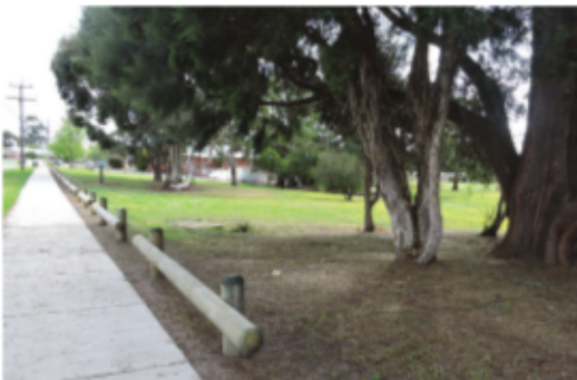
Footpath, Post and Rail Fencing (July 2016)