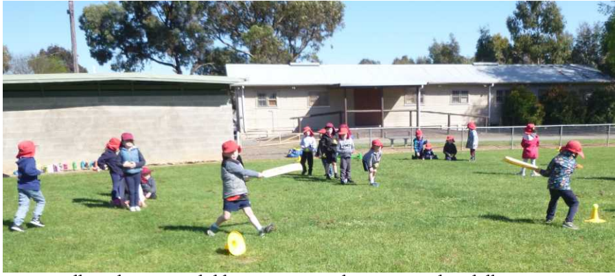
Brown Hill Kindergarten children trying out their new cricket skills.