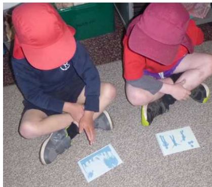
Children inspecting the finished product of their photography exercise. Image supplied.

rinsed in water and transformed into the completed image. Chemical changes occurred in both the exposure and wash stages of the activity, resulting in a silhouetted image on a blue background. The children were excited to share their photos with their families.