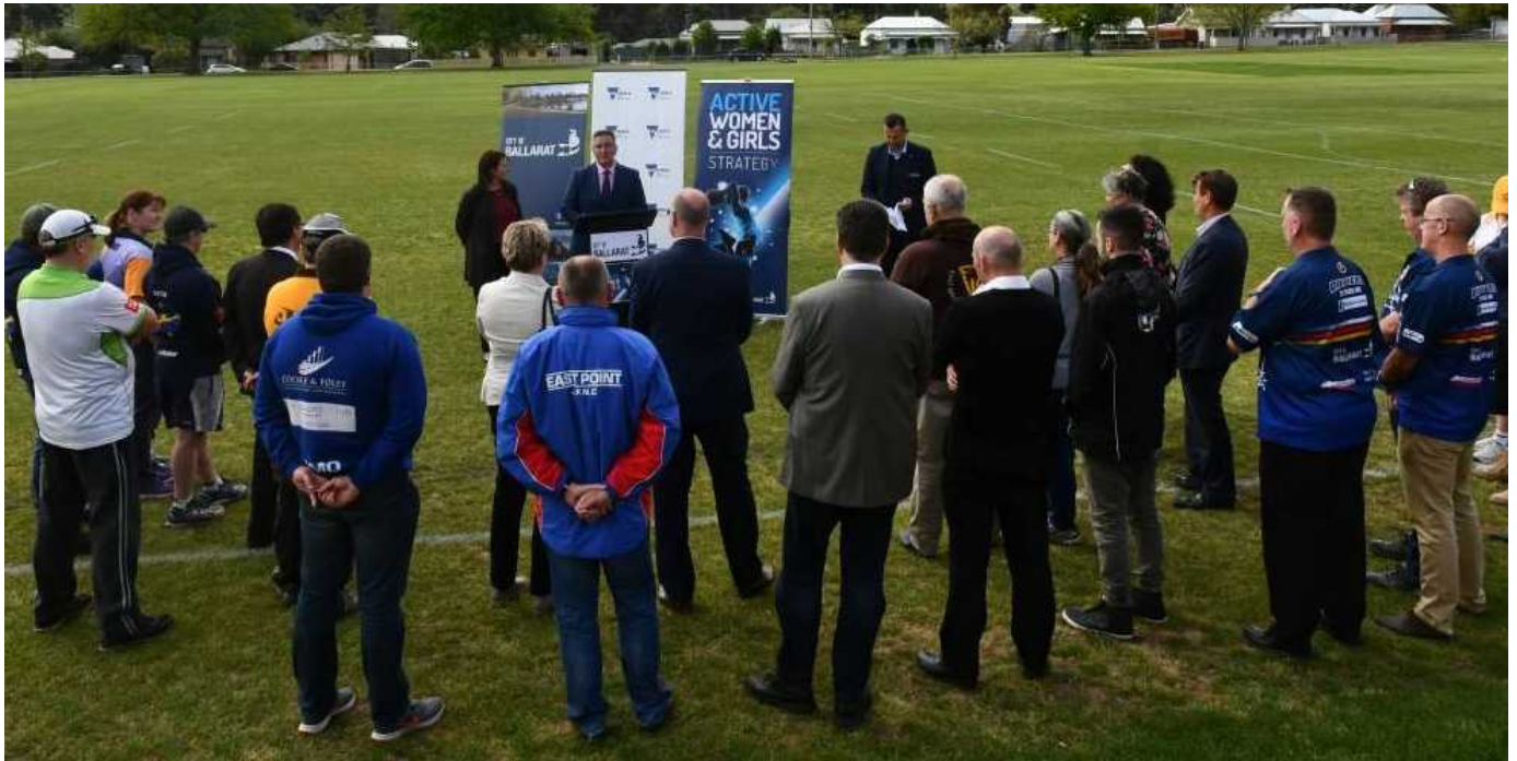
Members of the many groups that use Russell Square attend an announcement about the new lights.