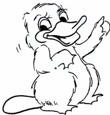
FireAware mascot, Penny Platypus

The Fire Danger Period has been declared for our area, the Central Fire District. This means fire restrictions come into force, so you cannot light a fire in the open air unless you have a permit or comply with certain requirements. Check out the CFA website for more details: http://www.cfa.vic.gov.au/warni