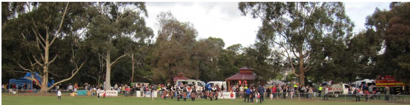
Brown Hill locals turned out in force to the third Brown Hill Community Festival and enjoyed a performance by the Federation University Pipe Band.