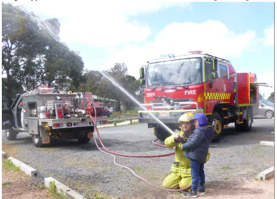
Squirting water with the CFA volunteers.